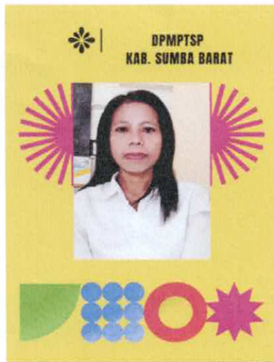
GRANDIS S.T.L, SE FRONT OFFICE